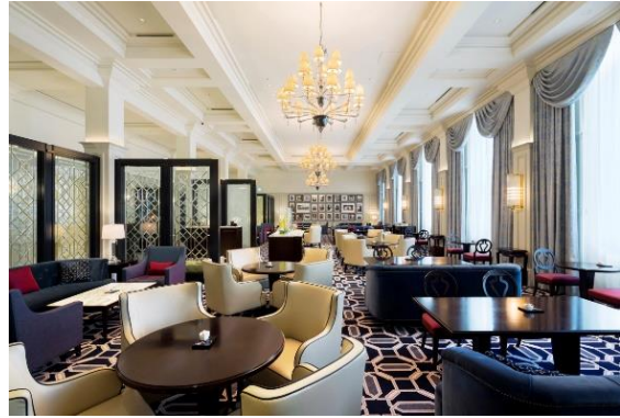
The Lobby Lounge