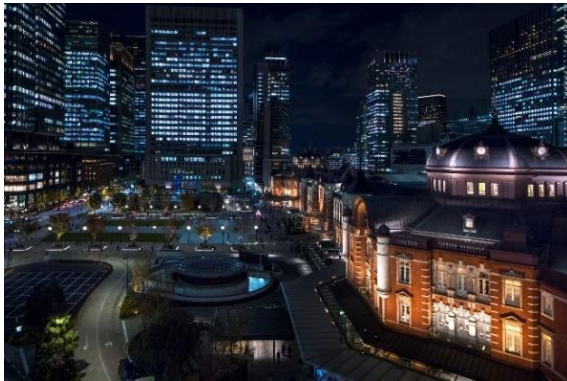
Exterior of The Tokyo Station Hotel

Facebook: https://www.facebook.com/tokyostationhotel/